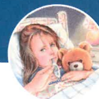
Colds and viruses